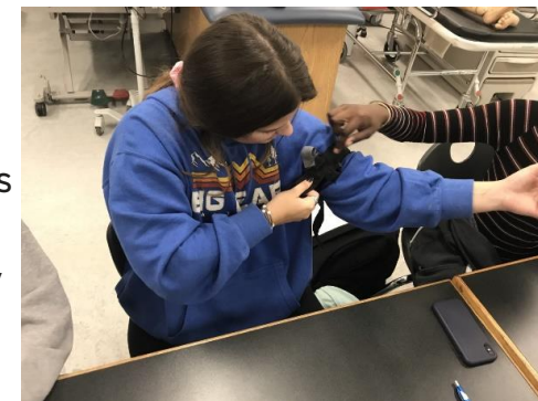
Students pack wounds & apply tourniquets during a training by Vanderbilt Medical Center