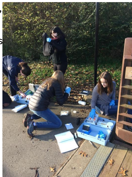
Water Testing at Warner Park Endangered Species Specialist