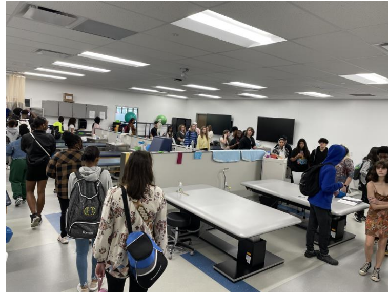
AGHS Students touring the Triage simulation lab at TSU