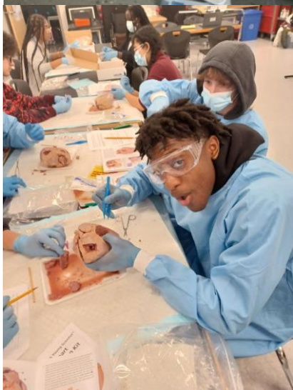
AGHS students dissecting a brain in Anatomy & Physiology