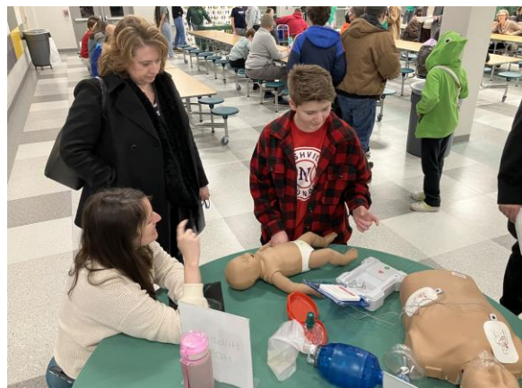
AGHS Students doing community outreach