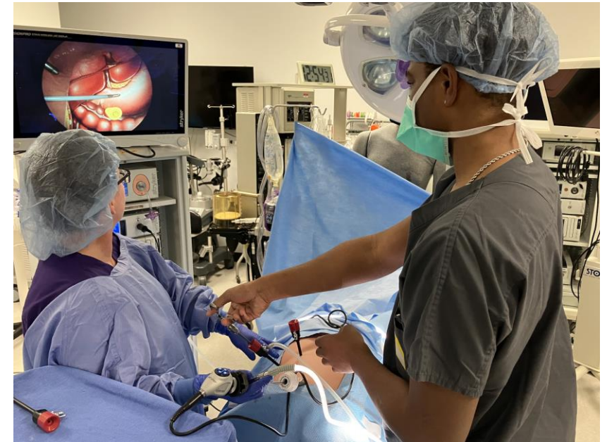
Students participate in mock surgery at SpecialtyCare