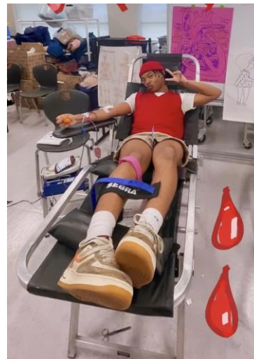
On campus blood drive with Blood Assurance HOSA members work registration